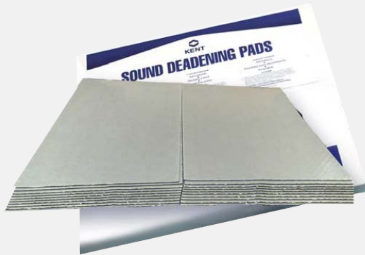
Part N°: 34652 : Sound Deadening Pads

Flexible laminated sound damping pads made of a mixture of bitumen, copolymers and fillers designed to give extremely good flexibility with ease of application to all areas of the motor vehicle.